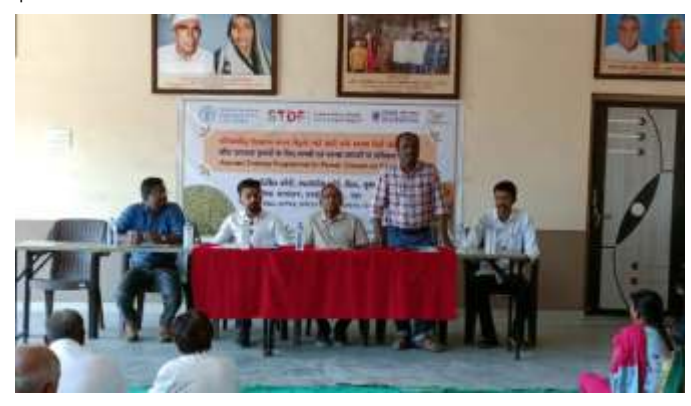
Three-day training programme on good agricultural practices (GAP) and good hygienic practices (GHP) for fennel

Spices Board Regional Office, Unjha, Gujarat conducted a three-days training programme on Good Agricultural Practices (GAP) and Good Hygienic Practices (GHP) for fennel growers of the village Umta, Mehsana district in Gujarat under the project titled 'Strengthening spice value chain in India and improving market access through capacity building and innovative interventions' funded by Standards and Trade Development Facility (STDF) during 17- 19 October, 2022. The farmers were trained on GAP and GHP with special focus on production of exportable IPM quality fennel. The training module included activities like site selection, seed selection, soil management, sowing, crop management, farm-level handling, IPM practices and hygienic practices.