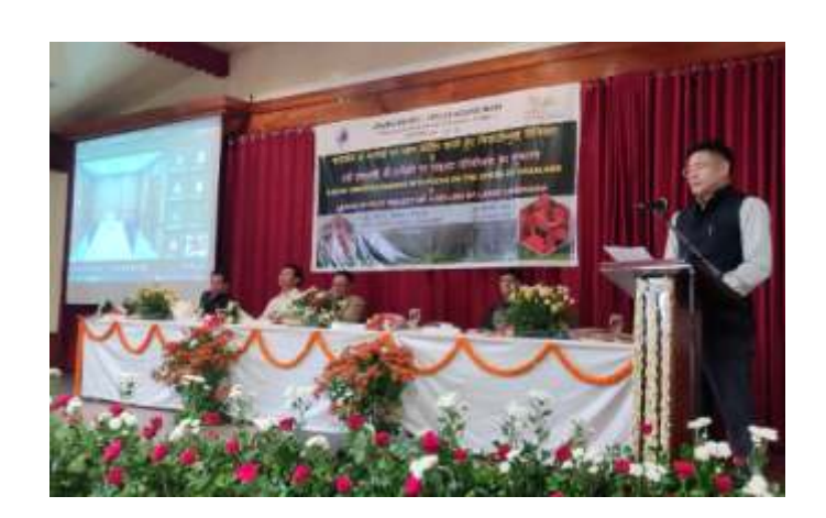
Glimpse of export oriented seminar with focus on Nagaland

An exhibition was also organized in the event with active participation from the Farmer Producer Companies from various parts of the NE region.