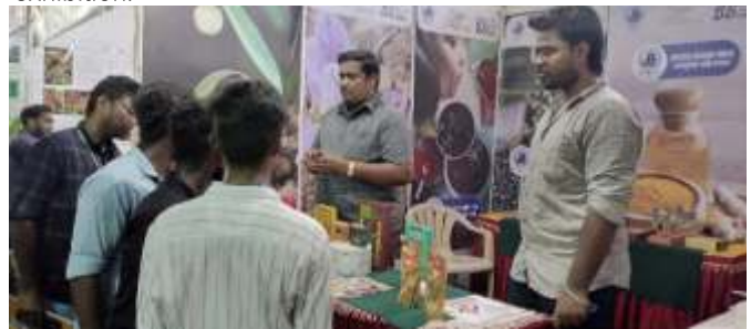
Stall put up by Spices Board during the State Level Farmers' Day

Farmers from all parts of Tamil Nadu and adjacent states visited the stalls arranged by various Government departments, FPOs, Women SHGs, etc. Unique products like spice based herbal tea, spice flavoured ice cream, spice blended honey, etc. were displayed by the FPOs. Dr M. Shanthi, Director, Center for Plant Protection Studies, TNAU visited the Board's stall and appreciated the efforts taken by the Board. Several seminars were also organised by the TNAU in conjunction with the exhibition.