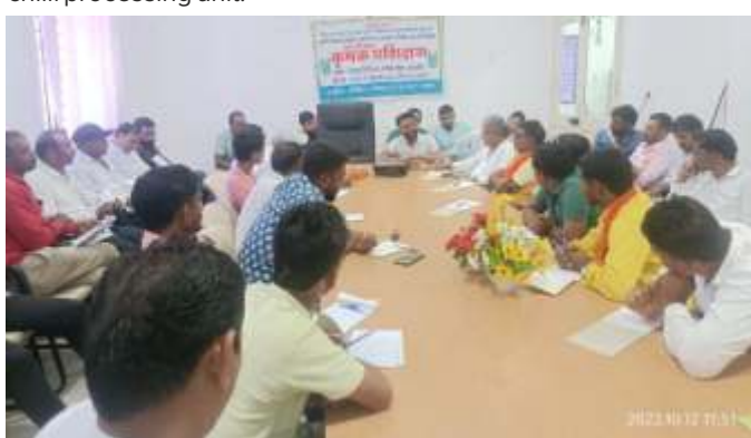
Chilli growers along with officials of Spices Board during technical session

An exposure visit of farmers to Spices Board, Guntur was organised jointly by ATMA and Horticulture department of Khargone, Madhya Pradesh during 12-14 October 2022. Fifty chilli farmers from various FPOs of the district attended the exposure visit. During the technical session, the officials briefed on good agricultural practices, good hygienic practices, export opportunities of chilli, importance of soil testing, value-addition, diseases and their management, pre and post-harvest operations and so on. On the second day, farmers visited local markets and learnt how the market works. Farmers checked all kinds of chilli coming to the market from various places and made a comparative analysis. Farmers along with officials of Spices Board visited the Horticulture Research Lab, Spices Park and chilli processing unit.