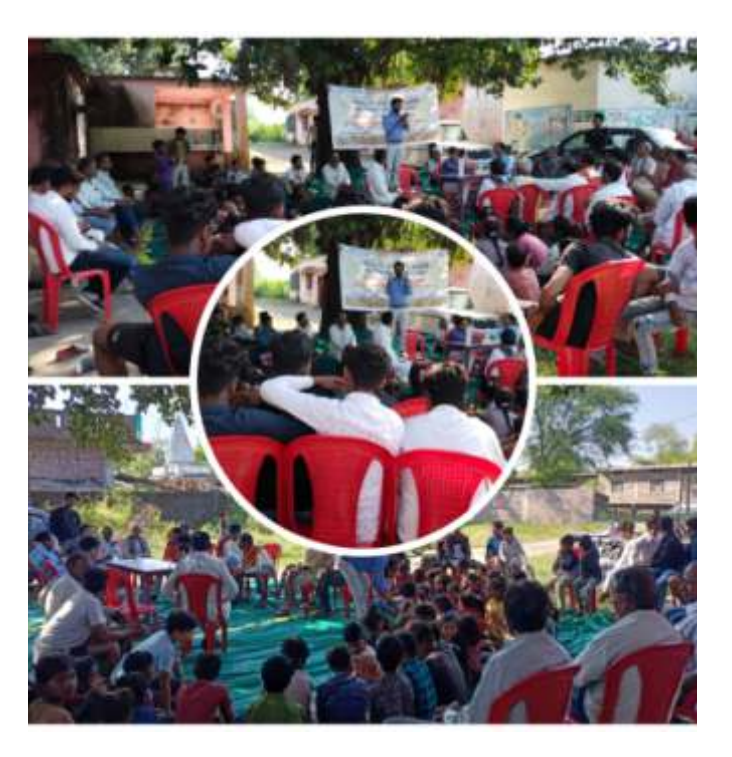
Training on good agricultural practices and good hygienic practices for coriander growers

Spices Board Regional Office, Guna conducted training on good agricultural practices and good hygienic practices for coriander growers of villages Gulwada and Kumbhraj, Guna, Madhya Pradesh on 18 October 2022.